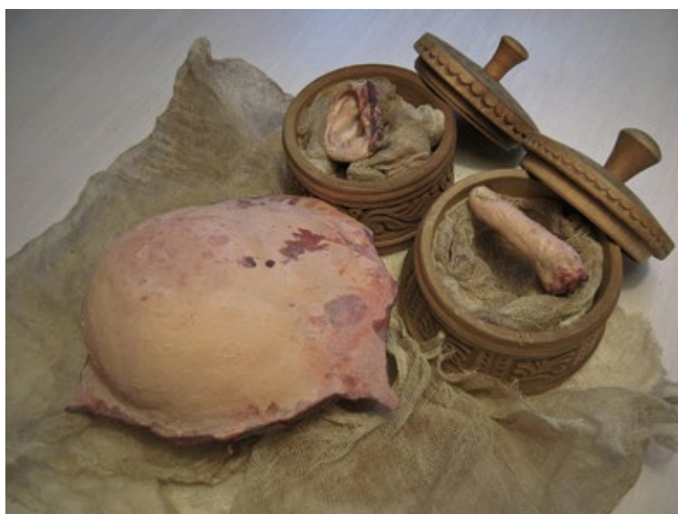
Completorium: Relics of St. Lugaardis.